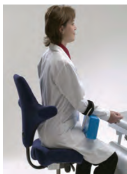
Standard Seating Position