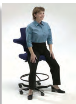
Sit Stand Position